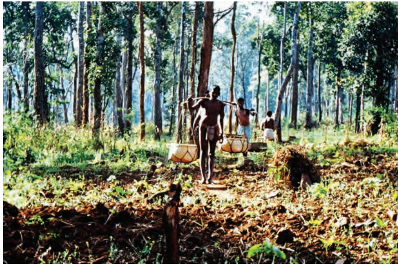
Fig. 14 – Bringing grain from the threshing grounds to the field.

The men are carrying grain in baskets from the threshing fields. Men carry the baskets slung on a pole across their shoulders, while women carry the baskets on their heads.