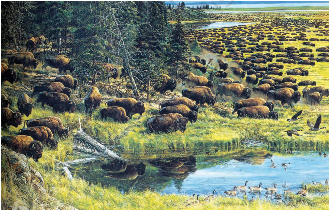
Fig.2 – When the valleys were full. Painting by John Dawson. Native Americans like the Lakota tribe who lived in the Great North American Plains had a diversified economy. They cultivated maize, foraged for wild plants and hunted bison. Keeping vast areas open for the bison to range in was seen by the English settlers as wasteful. After the 1860s the bisons were killed in large numbers.

In 1600, approximately one-sixth of India's landmass was under cultivation. Now that figure has gone up to about half. As population increased over the centuries and the demand for food went up, peasants extended the boundaries of cultivation, clearing forests and breaking new land. In the colonial period, cultivation expanded rapidly for a variety of reasons. First, the British directly encouraged