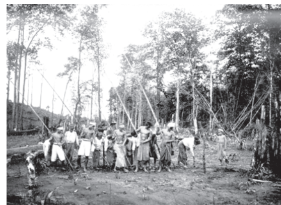
Fig. 15 – Taungya cultivation was a system in which local farmers were allowed to cultivate temporarily within a plantation. In this photo taken in Tharrawaddy division in Burma in 1921 the cultivators are sowing paddy. The men make holes in the soil using long bamboo poles with iron tips. The women sow paddy in each hole.

Children living around forest areas can often identify hundreds of species of trees and plants. How many species of trees can you name?