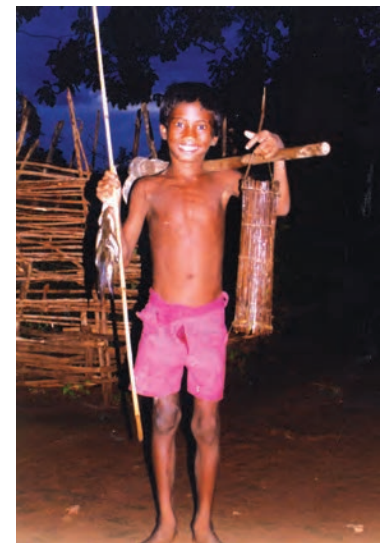
Fig. 17 – The little fisherman. Children accompany their parents to the forest and learn early how to fish, collect forest produce and cultivate. The bamboo trap which the boy is holding in his right hand is kept at the mouth of a stream – the fish flow into it.

While the forest laws deprived people of their customary rights to hunt, hunting of big game became a sport. In India, hunting of tigers and other animals had been part of the culture of the court and nobility for centuries. Many Mughal paintings show princes and emperors enjoying a hunt. But under colonial rule the scale of hunting increased to such an extent that various species became almost extinct. The British saw large animals as signs of a wild, primitive and savage society. They believed that by killing dangerous animals the British