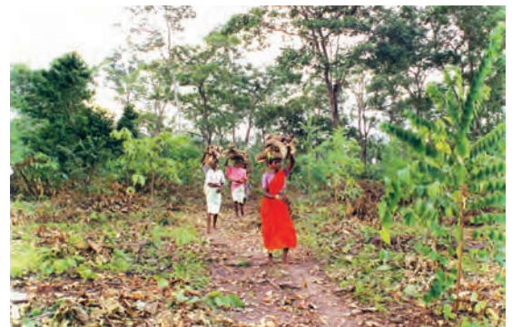
Fig.6 - Women returning home after collecting fuelwood.