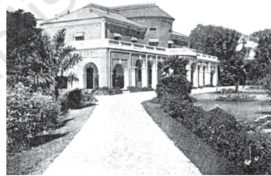
Fig. 11 – The Imperial Forest School, Dehra Dun, India. The first forestry school to be inaugurated in the British Empire.

Foresters and villagers had very different ideas of what a good forest should look like. Villagers wanted forests with a mixture of species to satisfy different needs – fuel, fodder, leaves. The forest department on the other hand wanted trees which were suitable for building