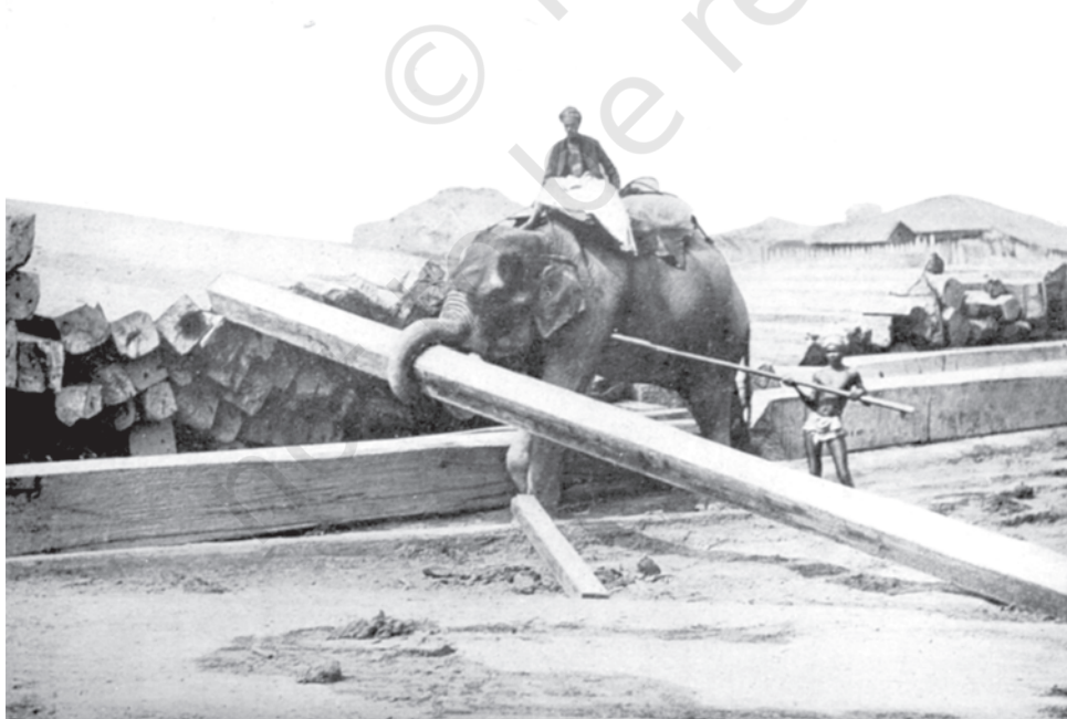
Fig.5 – Elephants piling squares of timber at a timber yard in Rangoon. In the colonial period elephants were frequently used to lift heavy timber both in the forests and at the timber yards.