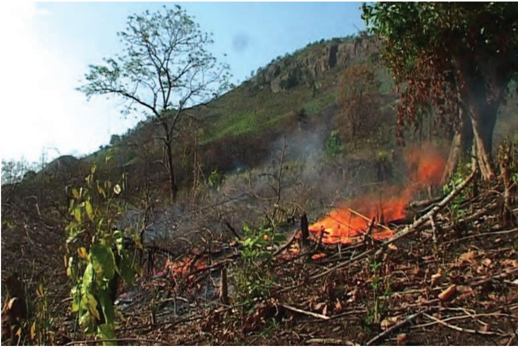
Fig. 16 – Burning the forest penda or podu plot. In shifting cultivation, a clearing is made in the forest, usually on the slopes of hills. After the trees have been cut, they are burnt to provide ashes. The seeds are then scattered in the area, and left to be irrigated by the rain.

Shifting cultivation also made it harder for the government to calculate taxes. Therefore, the government decided to ban shifting cultivation. As a result, many communities were forcibly displaced from their homes in the forests. Some had to change occupations, while some resisted through large and small rebellions.