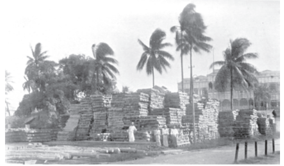
Fig.23 – Indian Munitions Board, War Timber Sleepers piled at Soolay pagoda ready for shipment, 1917.

Since the 1980s, governments across Asia and Africa have begun to see that scientific forestry and the policy of keeping forest communities away from forests has resulted in many conflicts. Conservation of forests rather than collecting timber has become a more important goal. The government has recognised that in order to meet this goal, the people who live near the forests must be involved. In many cases, across India, from Mizoram to Kerala, dense forests have survived only because villages protected them in sacred groves known as sarnas , devarakudu , kan , rai , etc. Some villages have been patrolling their own forests, with each household taking it in turns, instead of leaving it to the forest guards. Local forest communities and environmentalists today are thinking of different forms of forest management.