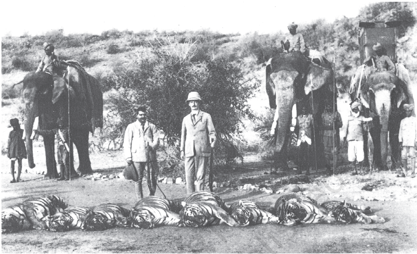
Fig.18 – Lord Reading hunting in Nepal.

Count the dead tigers in the photo. When British colonial officials and Rajas went hunting they were accompanied by a whole retinue of servants. Usually, the tracking was done by skilled village hunters, and the Sahib simply fired the shot.