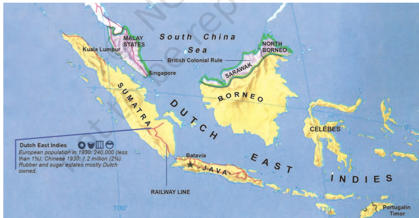
Fig. 22 – Most of Indonesia's forests are located in islands like Sumatra, Kalimantan and West Irian. However, Java is where the Dutch began their 'scientific forestry'. The island, which is now famous for rice production, was once richly covered with teak.

Dirk van Hogendorp, cited in Peluso, Rich Forests, Poor People , 1992.