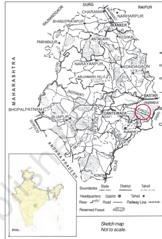
Fig. 20 – Bastar in 2000.

This photograph of an army camp was taken in Bastar in 1910. The army moved with tents, cooks and soldiers. Here a sepoy is guarding the camp against rebels.