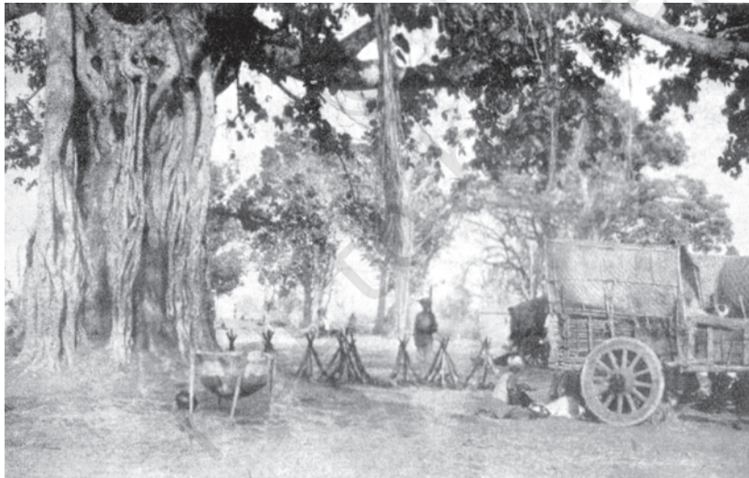
Fig. 19 – Army camp in Bastar, 1910.

Bastar is located in the southernmost part of Chhattisgarh and borders Andhra Pradesh, Orissa and Maharashtra. The central part of Bastar is on a plateau. To the north of this plateau is the Chhattisgarh plain and to its south is the Godavari plain. The river Indrawati winds across Bastar east to west. A number of different communities live in Bastar such as Maria and Muria Gonds, Dhurwas, Bhatras and Halbas. They speak different languages but share common customs and beliefs. The people of Bastar believe that each village was given its land by the Earth, and in return, they look after