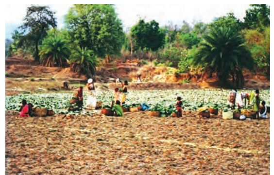
Fig. 13 – Drying tendu leaves.

The Forest Act meant severe hardship for villagers across the country. After the Act, all their everyday practices – cutting wood for their