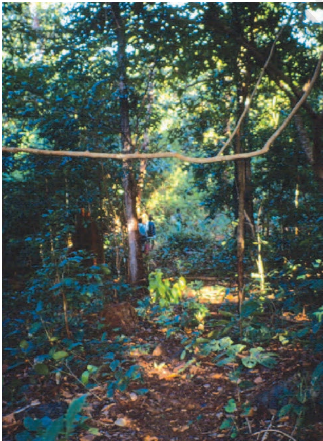
Fig. 1 – A sal forest in Chhattisgarh.

A lot of this diversity is fast disappearing. Between 1700 and 1995, the period of industrialisation, 13.9 million sq km of forest or 9.3 per cent of the world's total area was cleared for industrial uses, cultivation, pastures and fuelwood.