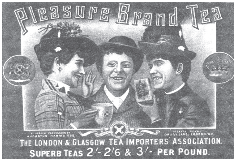
Fig.8 – Pleasure Brand Tea.

Large areas of natural forests were also cleared to make way for tea, coffee and rubber plantations to meet Europe's growing need for these commodities. The colonial government took over the forests, and gave vast areas to European planters at cheap rates. These areas were enclosed and cleared of forests, and planted with tea or coffee.