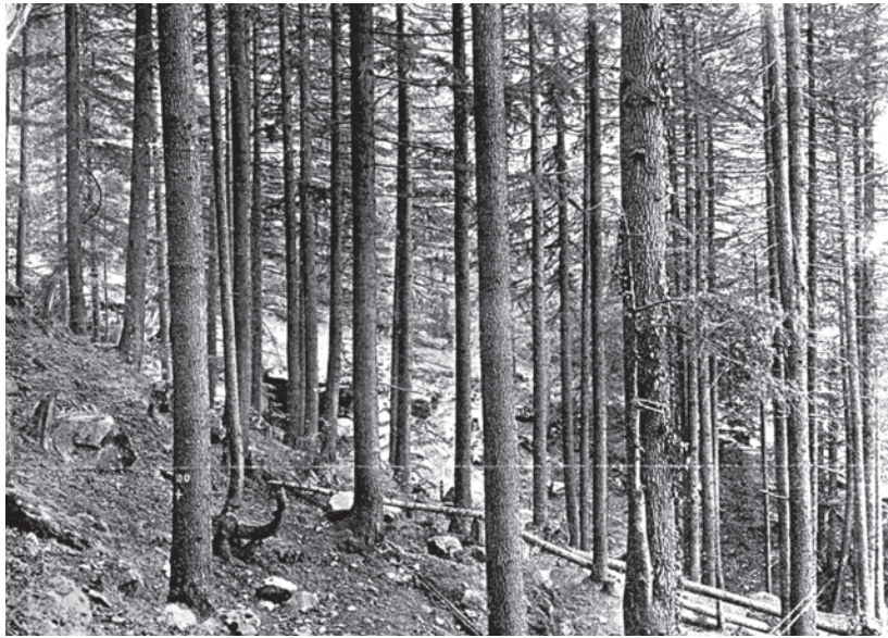
Fig. 10 – A deodar plantation in Kangra, 1933. From Indian Forest Records , Vol. XV.

punished. So Brandis set up the Indian Forest Service in 1864 and helped formulate the Indian Forest Act of 1865. The Imperial Forest Research Institute was set up at Dehradun in 1906. The system they taught here was called ‘ scientific forestry ’. Many people now, including ecologists, feel that this system is not scientific at all.