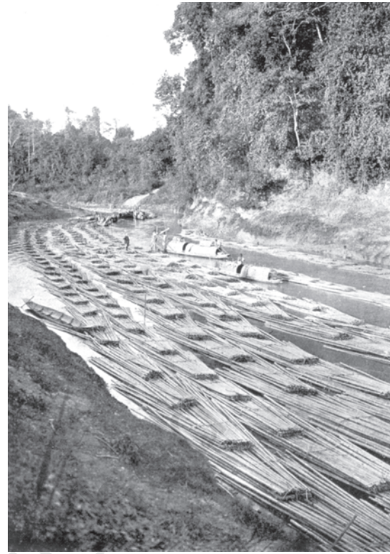
Fig.4 – Bamboo rafts being floated down the Kassalong river, Chittagong Hill Tracts.

From the 1860s, the railway network expanded rapidly. By 1890, about 25,500 km of track had been laid. In 1946, the length of the tracks had increased to over 765,000 km. As the railway tracks spread through India, a larger and larger number of trees were felled. As early as the 1850s, in the Madras Presidency alone, 35,000 trees were being cut annually for sleepers. The government gave out contracts to individuals to supply the required quantities. These contractors began cutting trees indiscriminately. Forests around the railway tracks fast started disappearing.