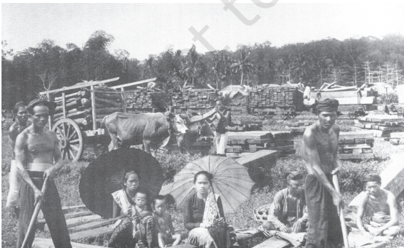
Fig.24 – Log yard in Rembang under Dutch colonial rule.

The Allies would not have been as successful in the First World War and the Second World War if they had not been able to exploit the resources and people of their colonies. Both the world wars had a devastating effect on the forests of India, Indonesia and elsewhere. The forest department cut freely to satisfy war needs.