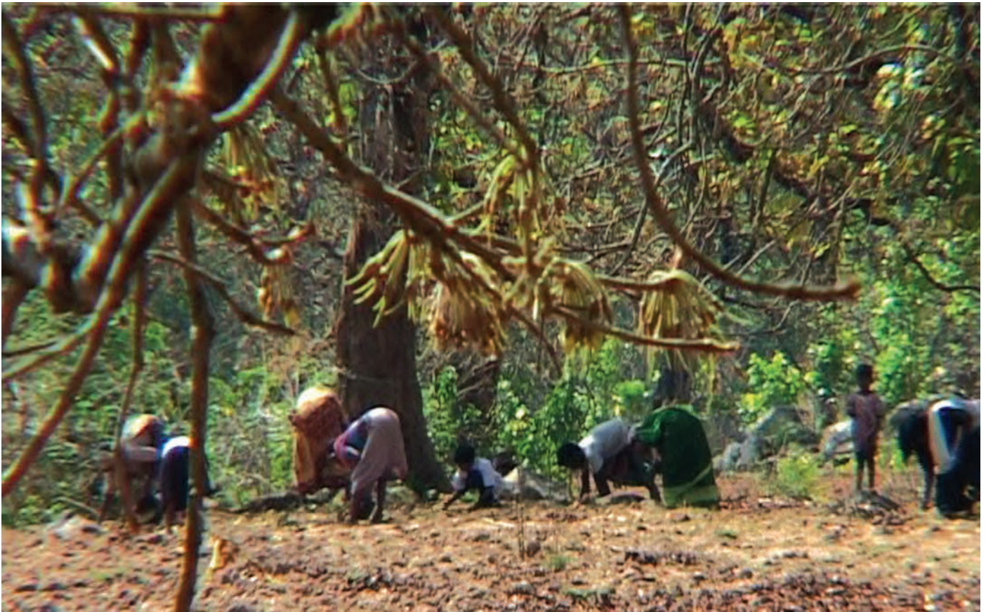
Fig. 12 – Collecting mahua ( Madhuca indica ) from the forests.

Villagers wake up before dawn and go to the forest to collect the mahua flowers which have fallen on the forest floor. Mahua trees are precious. Mahua flowers can be eaten or used to make alcohol. The seeds can be used to make oil.